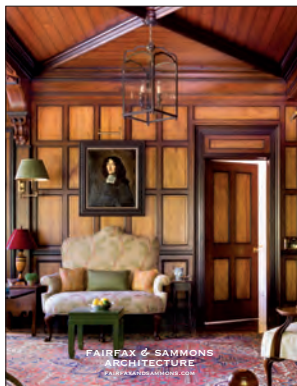
Fairfax & Sammons