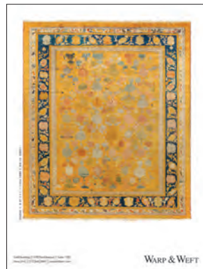
Warp and Weft